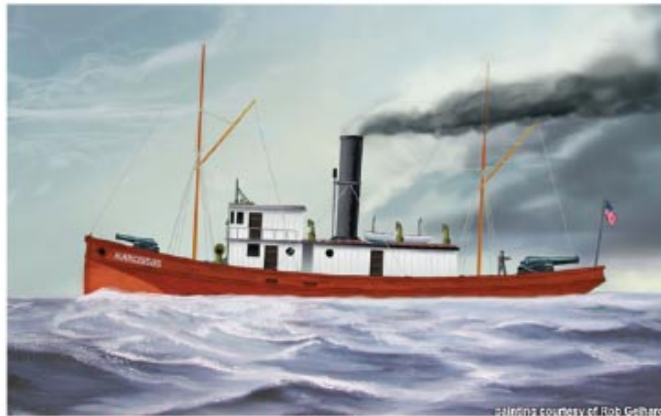
An artist's depiction of what USS Narcissus might have looked like.

mid-nineteenth century wooden tug boat built in Albany, New York in 1863 and commissioned to operate in the East Gulf Blockading Squadron during the Civil War. Overall size of the hull measured approximately 81 feet 6 inches long,