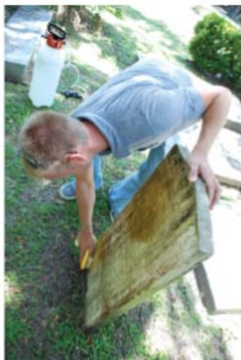
Participants learn the proper way to clean headstones in the field portion of the training. Bleach is the enemy of your historic cemetery!

FPAN centers throughout the state work in partnership with community groups to