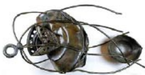
Lantern recovered from USS Narcissus, after conservation.

don't worry the site is also available to experience without jumping in the Gulf. Go to www.museumsinthesea.com to visit the site through video and still pictures. The website is also host to Florida's other underwater archaeological preserves or museums in the sea. If you are a diver or snorkeler however and have a hankering to go see the site for yourself, please remem-