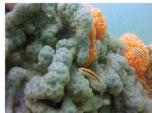
USS Narcissus is also home to diverse sea life!