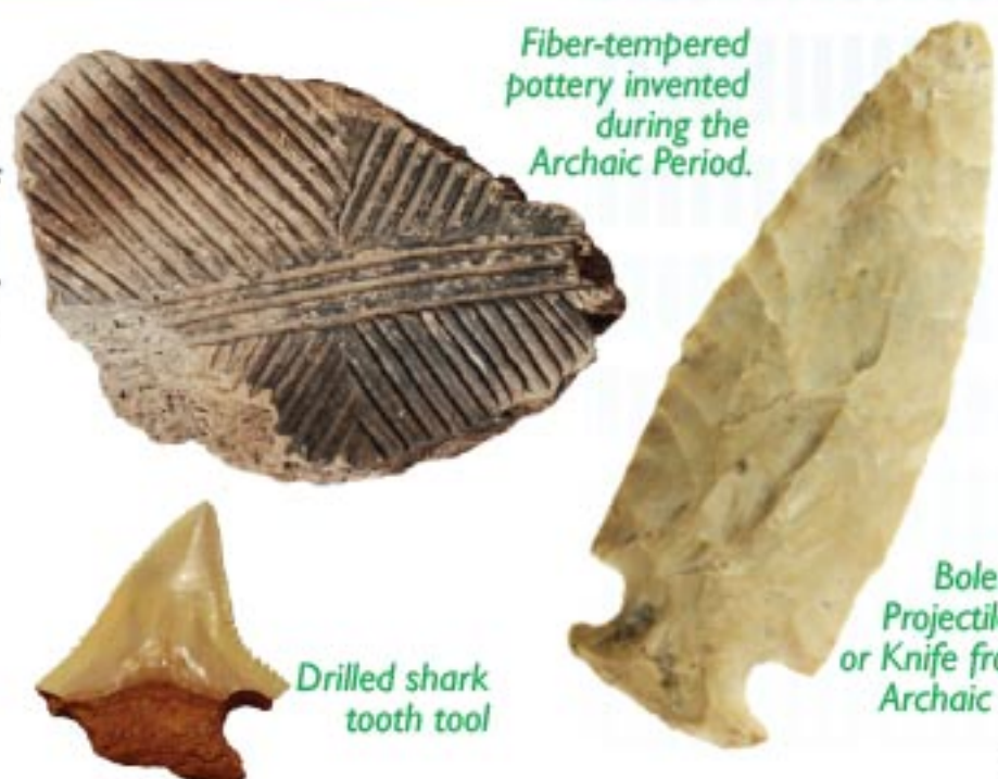
Fiber-tempered pottery invented during the Archaic Period.

Building on the timeline poster series established over the last two years, this year we will be highlighting (Continued on pg. 5)